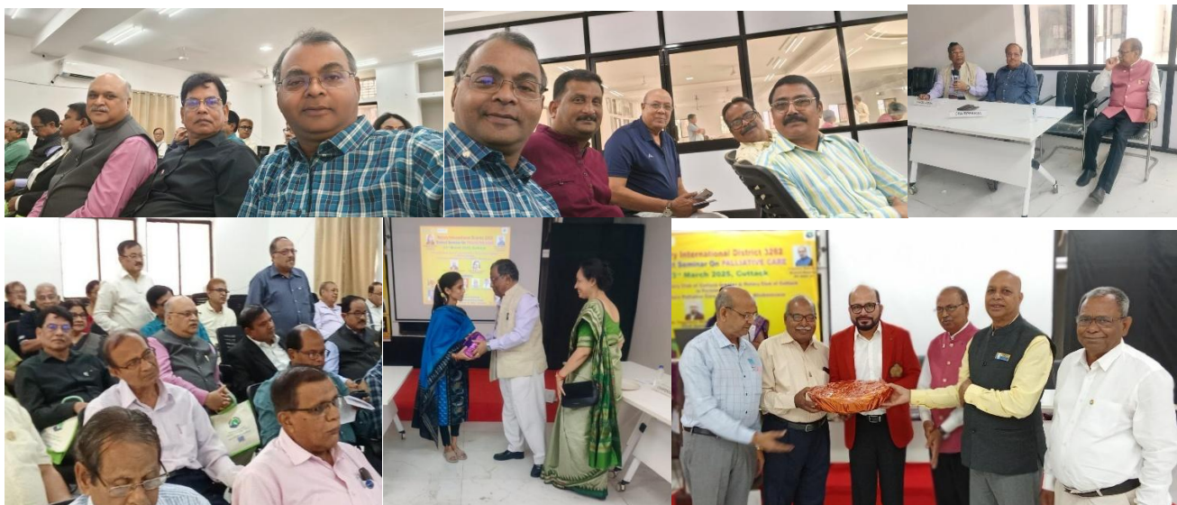
JPM RCC EYE HOSPITAL & RI